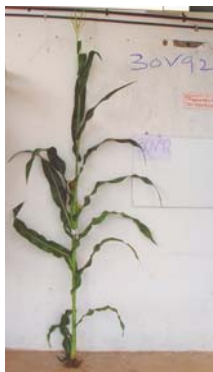
Figure 05: Maize: 30V92