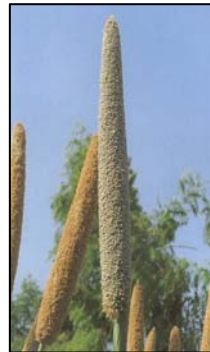
Figure 09: Pearl Millet: DGB-015