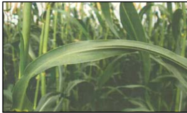
Figure 04: Pearl Millet: 86M52