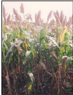
Figure 03: Sorghum: MIJ-005