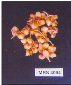
Figure 01: Sorghum: MRS 4094