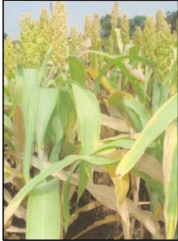
Figure 06: Sorghum: DGJ-020