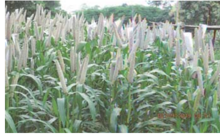
Figure 07: Pearl Millet: DGB-013