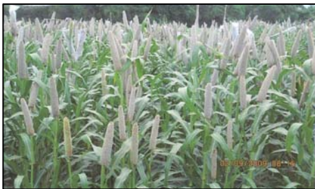
Figure 08: Pearl Millet: DGB-012