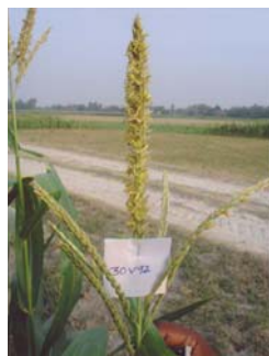
Figure 05a: General view of plant